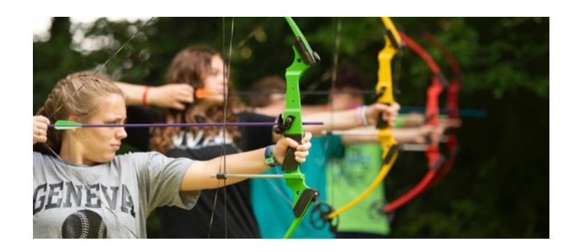
Black Rock Retreat 1345 Kirkwood Pike Quarryville, PA 17566

Example of a Chaperones Role in the Schedule